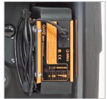
Warrior AXP scrubber includes a standard onboard battery charger for wet or gel battery packages.