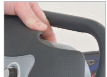
Soft-Touch™ Paddle System prevents finger pinching, provides maximum control, reduces repetitive-stress injuries, and prevents the operator from being pinned between the machine and an obstruction.