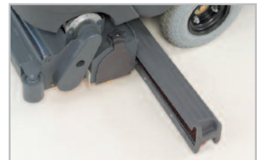
Cylindrical scrub decks sweep and scrub in a single pass with dual counter-rotating brushes. Polyethylene hopper eliminates corrosion.