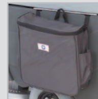
Onboard Tote Bag