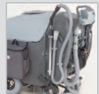
Onboard Scrub-Vac System